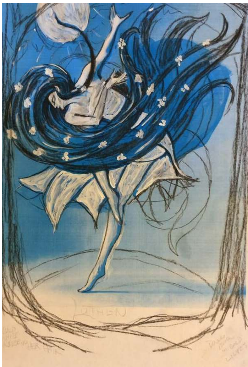
„DANCING LUTHIEN” BY TOM LOBACK